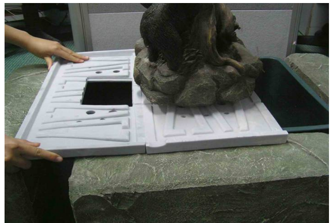
Install remaining side plates (2).