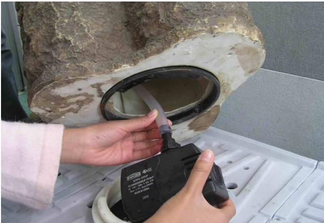
Connect tubing from feature to pump outlet.

We hope you will find these instructions helpful in setting up your fountain. If you need more information to properly care for your fountain, please DO NOT return the unit to place of purchase. Please visit our web site, www.angelodecor.com , for assistance and warranty information.