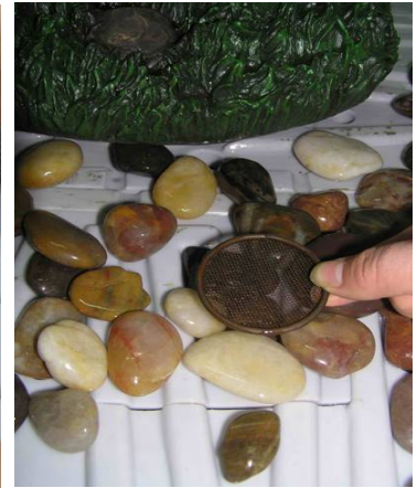
Install pump access door. Using tube provided, apply silicone along seams. Add decorative rocks on top of tray.